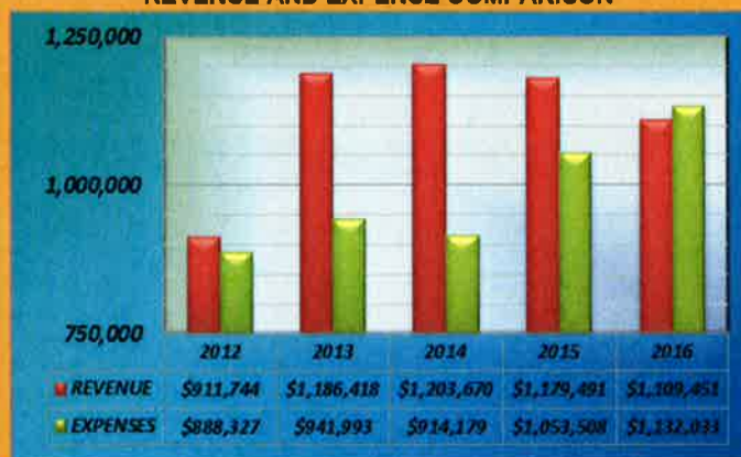
GENERAL FUND REVENUE AND EXPENSE COMPARISON

The Village was founded in a heavily forested area containing an abundance of fertile farmland. Over the past ten decades, this wooded landscape and its tranquil streams have provided refuge for those seeking a peaceful sense of community. . . we still hold dear the historical legacy of this Village and the legacies of those before us, and have maintained the unique, natural setting that is not so easily found today.