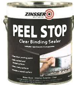
Zinsser Binding Peel Stop Primer

PEEL STOP is a clear, flexible bridging sealer for surfaces where peeling, flaking, dusting or chalking is a problem. Use indoors or out to form a breathable membrane over questionable or faulty substrates.